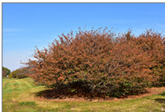
Satin Cloud Flowering Crab fruit