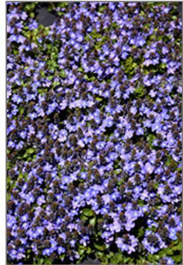
Turkish Speedwell flowers

Turkish Speedwell is recommended for the following landscape applications;