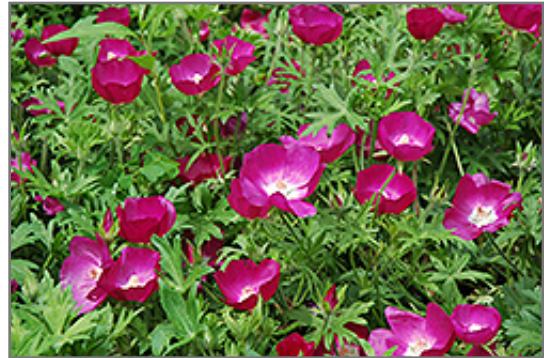
Buffalo Poppy flowers

Buffalo Poppy is recommended for the following landscape applications;