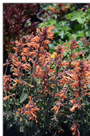
Kudos Mandarin Hyssop flowers