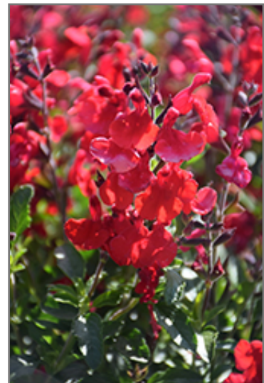
Radio Red Autumn Sage flowers