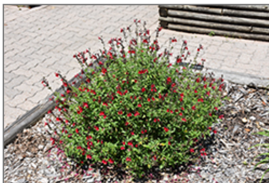
Radio Red Autumn Sage in bloom

Radio Red Autumn Sage is a fine choice for the garden, but it is also a good selection for planting in outdoor pots and containers. It is often used as a 'filler' in the 'spiller-thriller-filler' container combination, providing a mass of flowers against which the larger thriller plants stand out. Note that when growing plants in outdoor containers and baskets, they may require more frequent waterings than they would in the yard or garden.