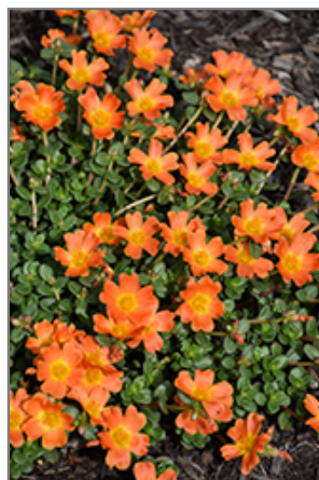
Mojave Tangerine Portulaca flowers