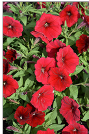
Trilogy Red Petunia flowers

Trilogy Red Petunia is recommended for the following landscape applications;