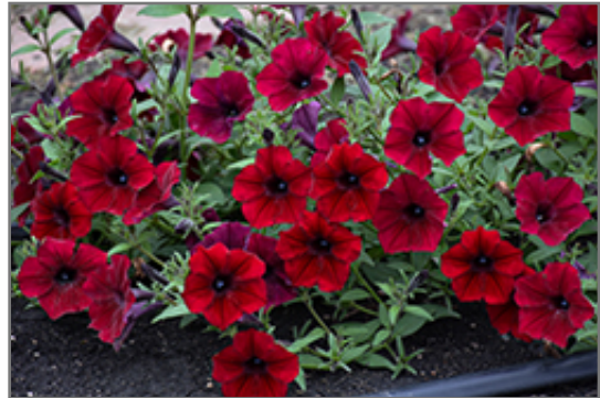
Tidal Wave Red Velour Petunia flowers

Tidal Wave Red Velour Petunia is a fine choice for the garden, but it is also a good selection for planting in outdoor containers and hanging baskets. Because of its trailing habit of growth, it is ideally suited for use as a 'spiller' in the 'spiller-thriller-filler' container combination; plant it near the edges where it can spill gracefully over the pot. Note that when growing plants in outdoor containers and baskets, they may require more frequent waterings than they would in the yard or garden.