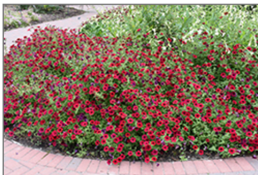
Tidal Wave Red Velour Petunia in bloom