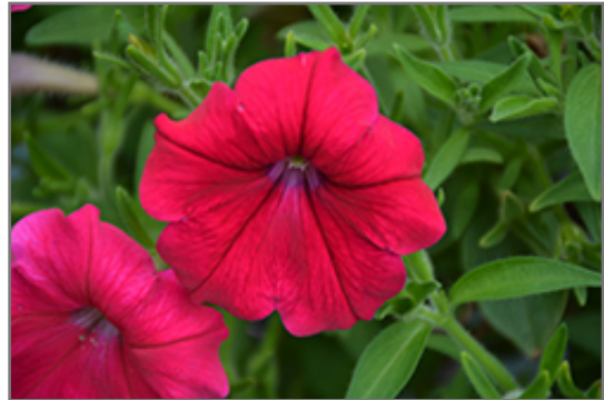
Success! Rose Petunia flowers