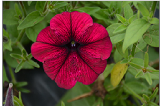
Success! Burgundy Petunia flowers