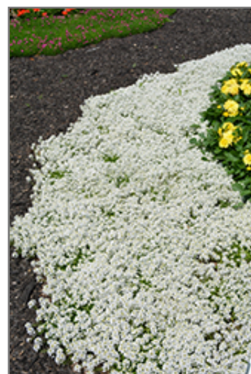
Yolo White Sweet Alyssum in bloom