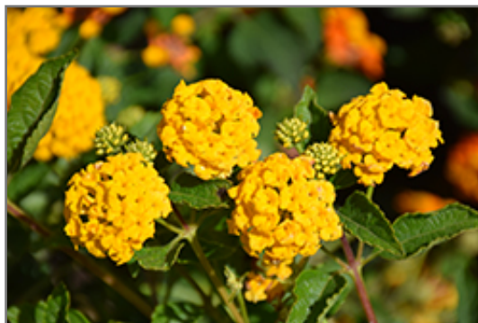
New Gold Lantana flowers