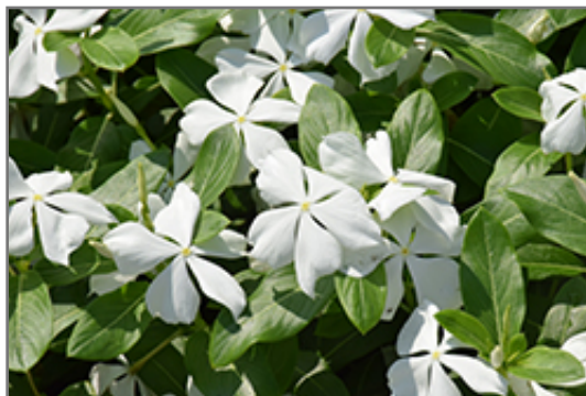
Valiant Pure White Vinca flowers

Valiant Pure White Vinca is recommended for the following landscape applications;