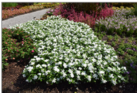
Valiant Pure White Vinca in bloom