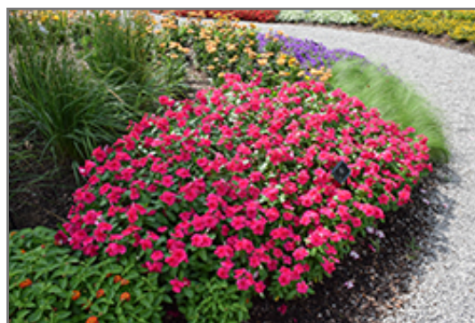
Valiant Punch Vinca in bloom