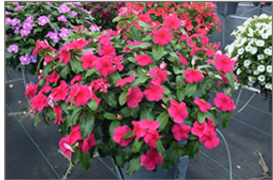
Valiant Punch Vinca in bloom

Valiant Punch Vinca will grow to be about 12 inches tall at maturity, with a spread of 18 inches. Its foliage tends to remain dense right to the ground, not requiring facer plants in front. Although it's not a true annual, this fast-growing plant can be expected to behave as an annual in our climate if left outdoors over the winter, usually needing replacement the following year. As such, gardeners should take into consideration that it will perform differently than it would in its native habitat.