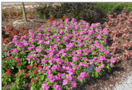
Valiant Lilac Vinca in bloom