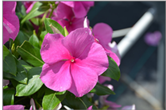
Valiant Lilac Vinca flowers

Valiant Lilac Vinca will grow to be about 12 inches tall at maturity, with a spread of 18 inches. Its foliage tends to remain dense right to the ground, not requiring facer plants in front. Although it's not a true annual, this fast-growing plant can be expected to behave as an annual in our climate if left outdoors over the winter, usually needing replacement the following year. As such, gardeners should take into consideration that it will perform differently than it would in its native habitat.