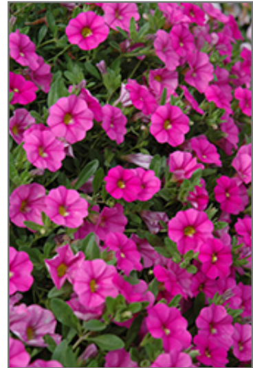
MiniFamous Neo Pink Calibrachoa flowers

MiniFamous Neo Pink Calibrachoa is recommended for the following landscape applications;