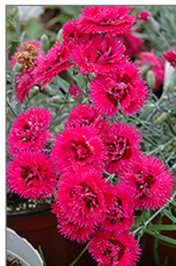
Starlette Pinks flowers