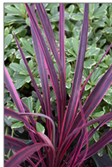
Electric Pink Cordyline foliage