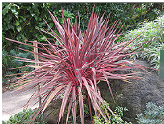
Electric Pink Cordyline

This plant does best in full sun to partial shade. It does best in average to evenly moist conditions, but will not tolerate standing water. It is not particular as to soil type or pH, and is able to handle environmental salt. It is somewhat tolerant of urban pollution. This is a selected variety of a species not originally from North America.