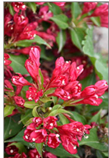
Crimson Kisses Weigela flowers