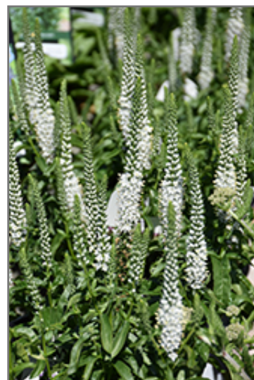
White Wands Speedwell flowers

White Wands Speedwell is recommended for the following landscape applications;