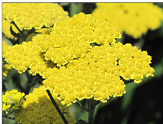
Moonshine Yarrow flowers

Moonshine Yarrow is recommended for the following landscape applications;