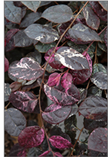
Jazz Hands Variegated Chinese Fringe-flower foliage

This plant is not reliably hardy in our region, and certain restrictions may apply; contact the store for more information.