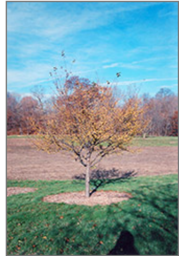
Winter Gold Flowering Crab fruit

This plant is not reliably hardy in our region, and certain restrictions may apply; contact the store for more information.