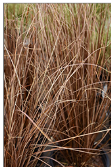
Red Rooster Sedge foliage