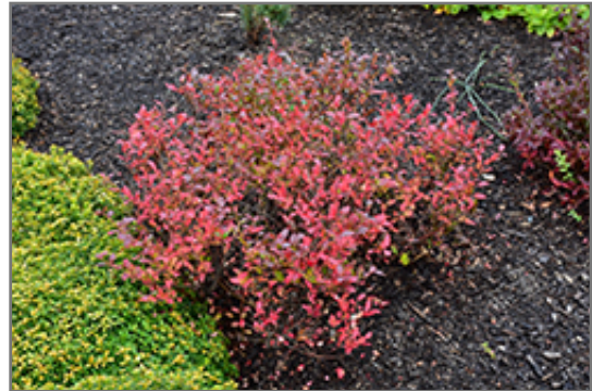
Lowbush Blueberry in fall