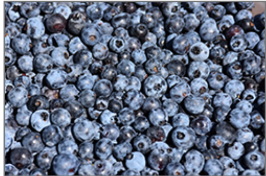
Lowbush Blueberry fruit

Lowbush Blueberry features dainty clusters of white bell-shaped flowers with shell pink overtones hanging below the branches in mid spring. It has dark green deciduous foliage. The oval leaves turn an outstanding scarlet in the fall. It features an abundance of magnificent blue berries in mid summer.