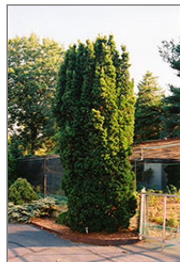
Sentinal Yew