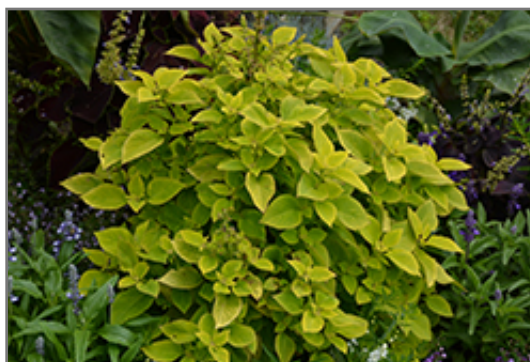
Premium Sun Lime Delight Coleus