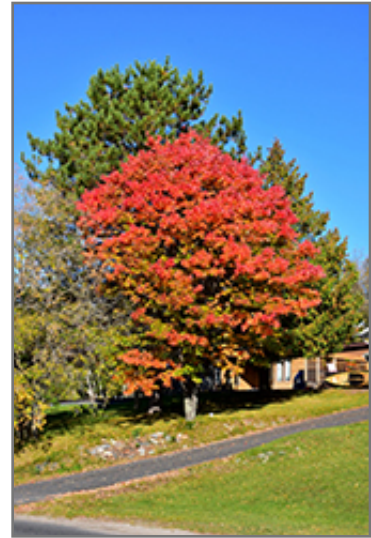
Red Maple in fall

This plant is not reliably hardy in our region, and certain restrictions may apply; contact the store for more information.