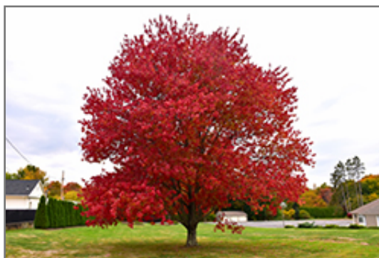
Red Maple in fall