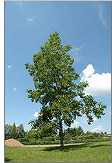
Bigtooth Aspen

Bigtooth Aspen will grow to be about 60 feet tall at maturity, with a spread of 40 feet. It has a high canopy with a typical clearance of 5 feet from the ground, and should not be planted underneath power lines. It grows at a fast rate, and under ideal conditions can be expected to live for 70 years or more.