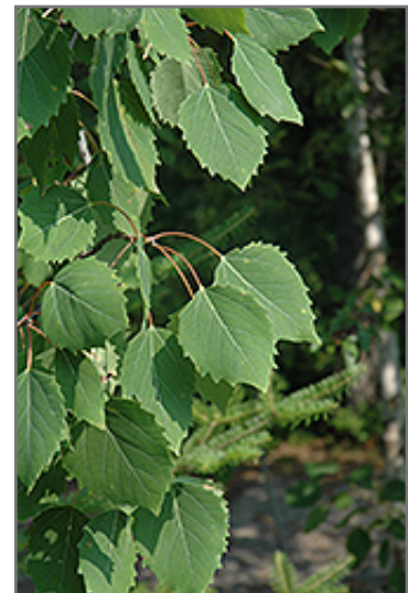
Bigtooth Aspen foliage