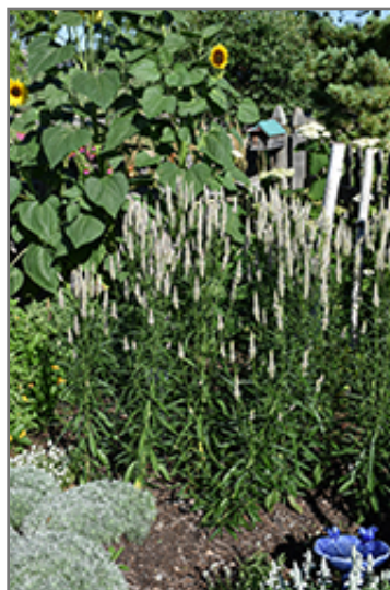
Flamingo Feather Celosia in bloom