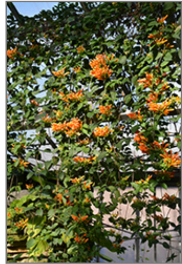
Flame Vine in bloom

This plant is not reliably hardy in our region, and certain restrictions may apply; contact the store for more information.