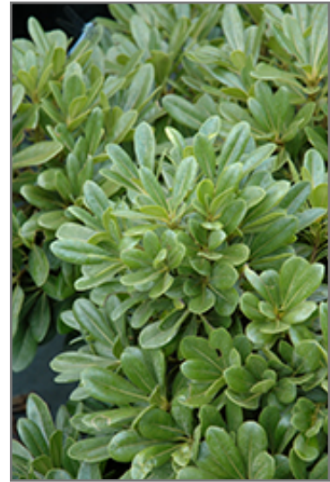
Wheeler's Dwarf Mock Orange foliage

This plant is not reliably hardy in our region, and certain restrictions may apply; contact the store for more information.