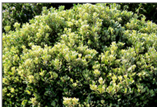
Wheeler's Dwarf Mock Orange in spring