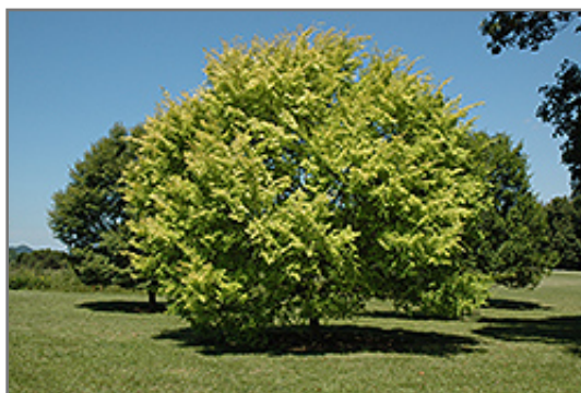
Golden Rey Elm