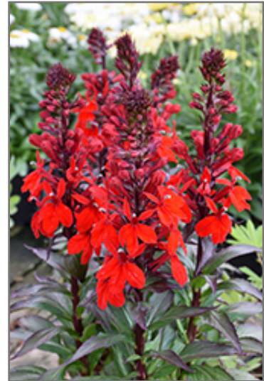
Starship Scarlet Lobelia flowers