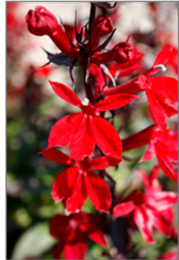
Starship Scarlet Lobelia flowers

Starship Scarlet Lobelia is a fine choice for the garden, but it is also a good selection for planting in outdoor pots and containers. With its upright habit of growth, it is best suited for use as a 'thriller' in the 'spiller-thriller-filler' container combination; plant it near the center of the pot, surrounded by smaller plants and those that spill over the edges. Note that when growing plants in outdoor containers and baskets, they may require more frequent waterings than they would in the yard or garden.