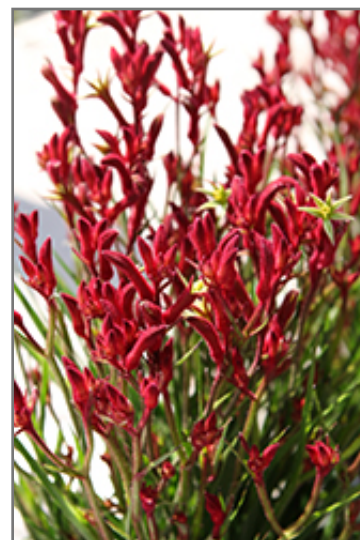
Big Red Kangaroo Paw flowers