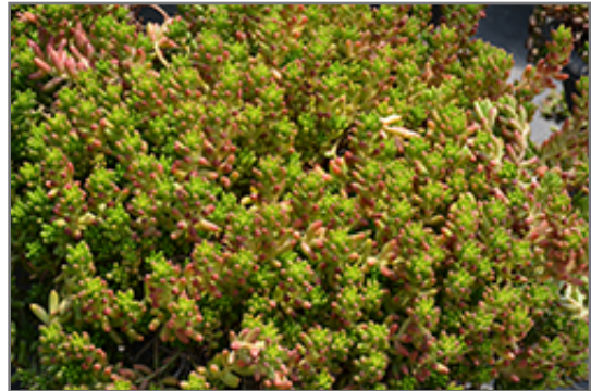
Jelly Bean Plant

Jelly Bean Plant is recommended for the following landscape applications;