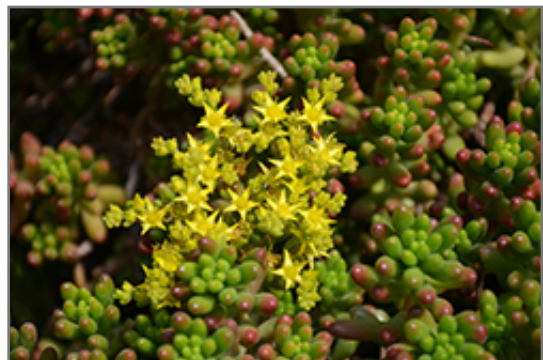
Jelly Bean Plant flowers