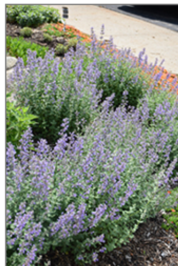
Purrsian Blue Catmint in bloom

Purrsian Blue Catmint is a fine choice for the garden, but it is also a good selection for planting in outdoor pots and containers. It is often used as a 'filler' in the 'spiller-thriller-filler' container combination, providing a mass of flowers against which the thriller plants stand out. Note that when growing plants in outdoor containers and baskets, they may require more frequent waterings than they would in the yard or garden. Be aware that in our climate, most plants cannot be expected to survive the winter if left in containers outdoors, and this plant is no exception. Contact our experts for more information on how to protect it over the winter months.