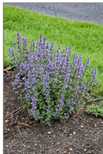
Purrsian Blue Catmint in bloom