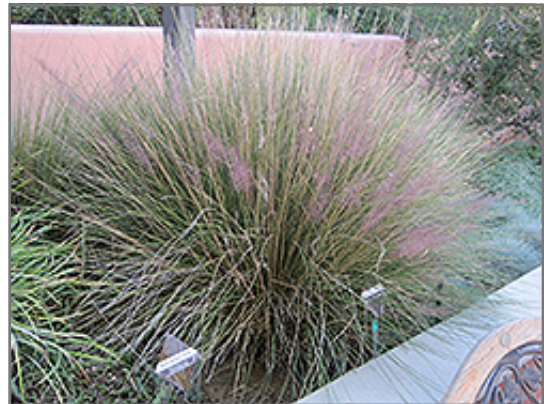
Pink Muhly Grass

Pink Muhly Grass is recommended for the following landscape applications;