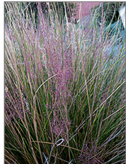
Pink Muhly Grass flowers