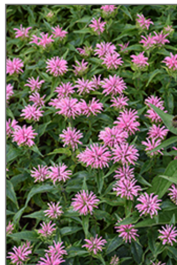
Pardon My Pink Beebalm flowers

Pardon My Pink Beebalm is recommended for the following landscape applications;