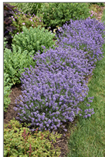
Essence Purple Lavender in bloom