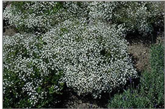
Summer Sparkles Baby's Breath in bloom

This plant is not reliably hardy in our region, and certain restrictions may apply; contact the store for more information.