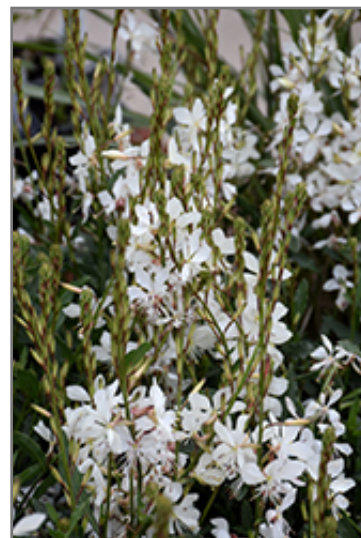
Sparkle White Gaura flowers