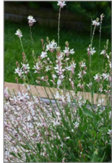
Sparkle White Gaura in bloom

Sparkle White Gaura is a fine choice for the garden, but it is also a good selection for planting in outdoor pots and containers. With its upright habit of growth, it is best suited for use as a 'thriller' in the 'spiller-thriller-filler' container combination; plant it near the center of the pot, surrounded by smaller plants and those that spill over the edges. It is even sizeable enough that it can be grown alone in a suitable container. Note that when growing plants in outdoor containers and baskets, they may require more frequent waterings than they would in the yard or garden.