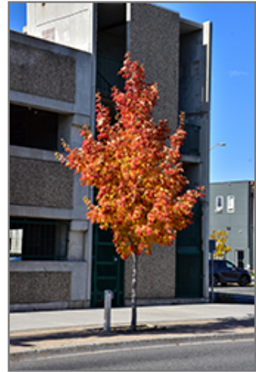
Lord Selkirk Sugar Maple in fall