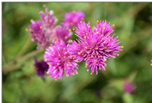
Fireworks Gomphrena flowers

Fireworks Gomphrena will grow to be about 24 inches tall at maturity extending to 3 feet tall with the flowers, with a spread of 3 feet. When grown in masses or used as a bedding plant, individual plants should be spaced approximately 30 inches apart. Its foliage tends to remain dense right to the ground, not requiring facer plants in front. Although it's not a true annual, this fast-growing plant can be expected to behave as an annual in our climate if left outdoors over the winter, usually needing replacement the following year. As such, gardeners should take into consideration that it will perform differently than it would in its native habitat.