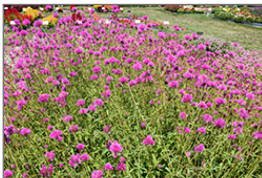
Fireworks Gomphrena in bloom