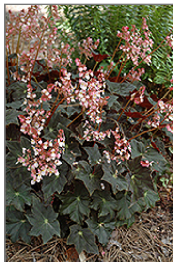
Joe Hayden Begonia flowers

Joe Hayden Begonia is recommended for the following landscape applications;