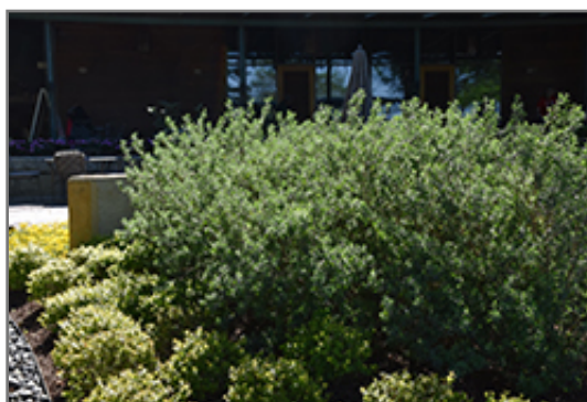
Texas Sage