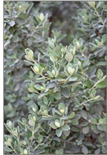
Texas Sage foliage

This plant is not reliably hardy in our region, and certain restrictions may apply; contact the store for more information.