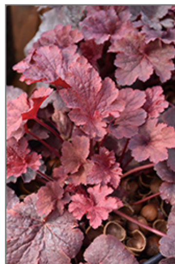
Cajun Fire Coral Bells foliage