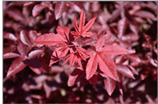
Rhode Island Red Japanese Maple foliage

Rhode Island Red Japanese Maple will grow to be about 12 feet tall at maturity, with a spread of 12 feet. It has a low canopy with a typical clearance of 3 feet from the ground, and is suitable for planting under power lines. It grows at a slow rate, and under ideal conditions can be expected to live for 80 years or more.