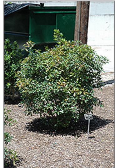
LeAnn Cleyera

This plant is not reliably hardy in our region, and certain restrictions may apply; contact the store for more information.