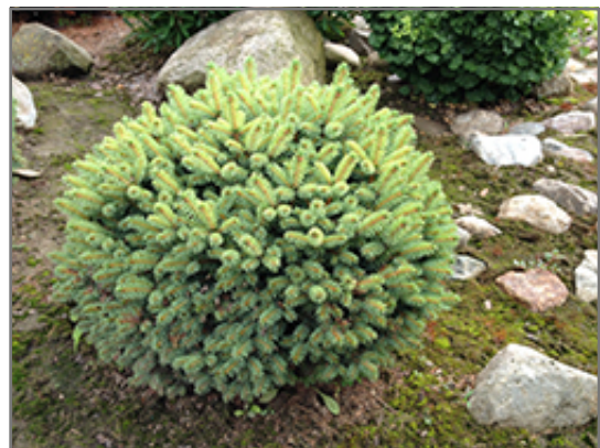
Roundabout Blue Spruce